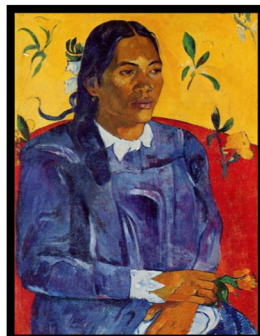
Gauguin's First DeYoung Exhibit: A Spiritual Journey November 17, 2018 - April 7, 2019